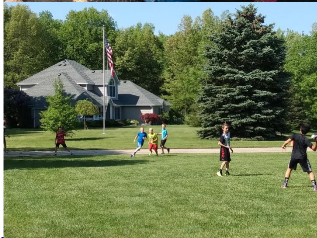
Thank you, Thank you very Much!