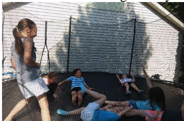
Celebrating with dinner at Mr. Kromer's house included some fun outdoors.