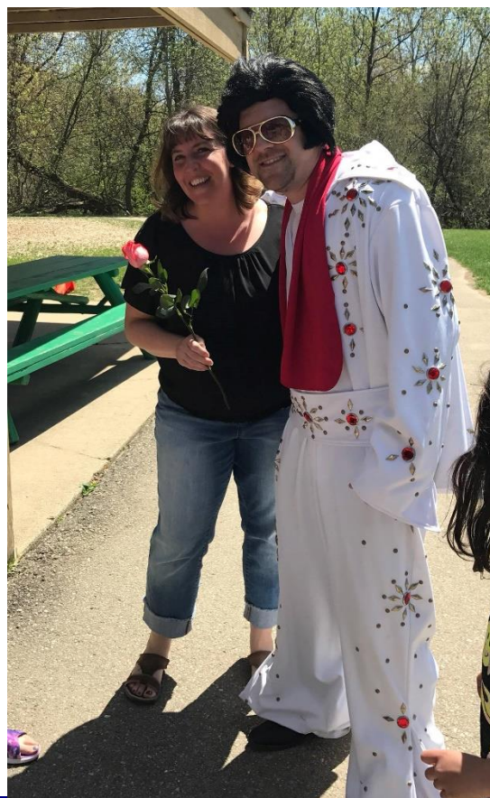
Staff appreciation week was fabulous!